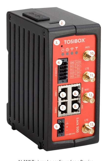
* LAN3 Port can be configured as a Service Port